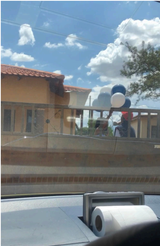
Dropping of some balloons during a taxi ride.