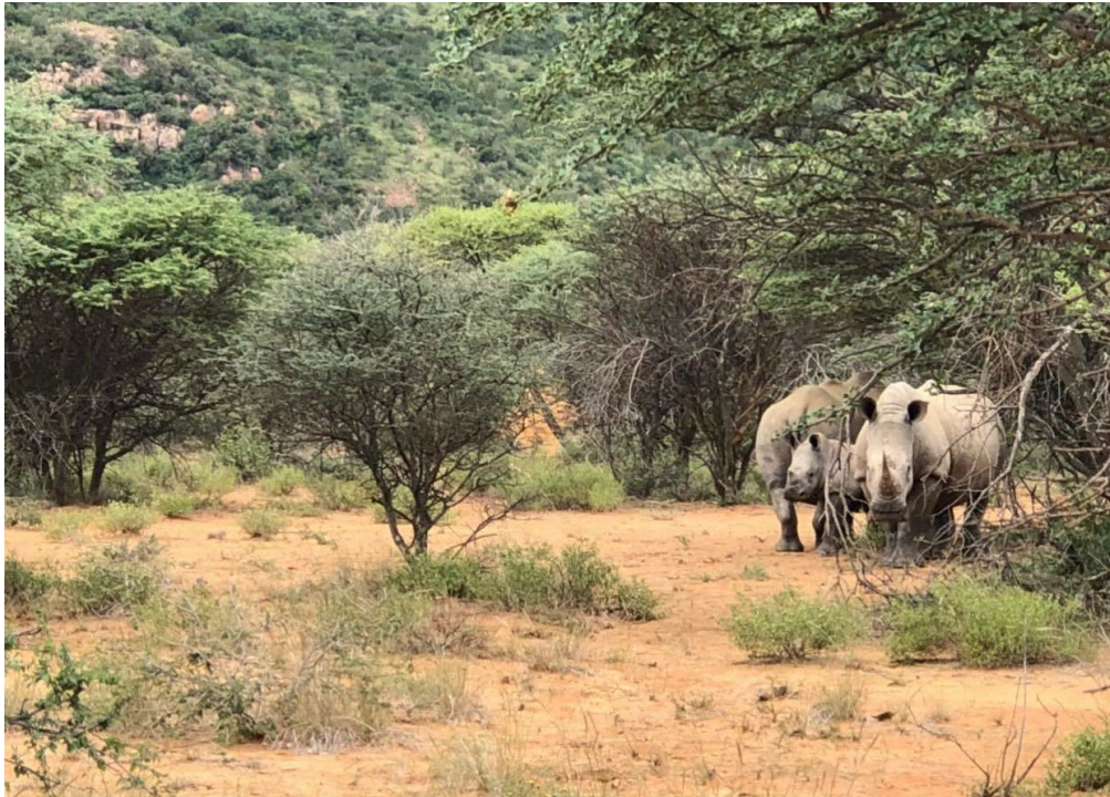
Cute rhino family.