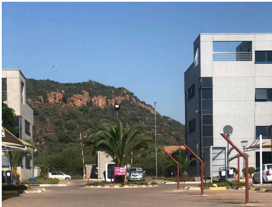
Entrance at Botho University with Kgale Hill in the background.

There is no washing machine, so you either have to wash by hand or try to hand it in to a laundromat. In my experience, laundromats were expensive, so I went for hand washing. We had a balcony both in the apartment and a large roof terrace where things dried quickly.