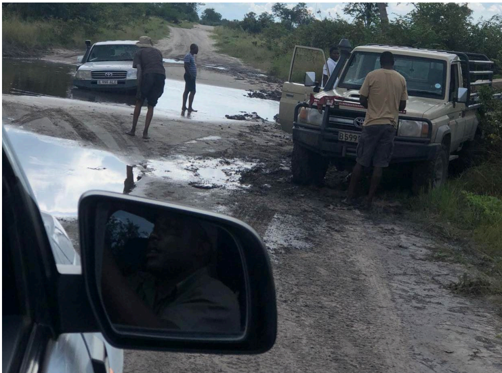
Don't get stuck in the mud during your travels.