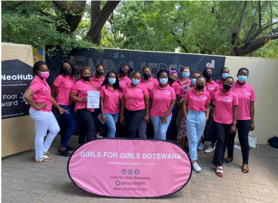
During a G4G event at the NeoHub in Gaborone.

I also engaged in a course or project called Girls for Girls Botswana that was highly rewarding, fun, and educating. You also got to meet a lot of ambitious and interesting local people who give lectures on equality and very openly shares their experiences on the matter and discuss their way to success. It was also a great way to meet friends.