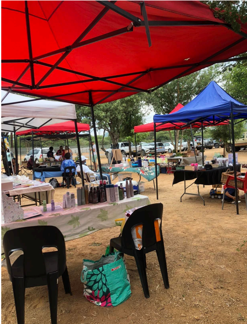
Farmers market once a month with food, books, local crafts etc.

If you want to travel, save some money because it's really expensive. Flights are much costlier than in Europe and lodges are very pricy. I did however mention that I was a student and was offered discounts at two separate lodges, I recommend you do the same if you go.