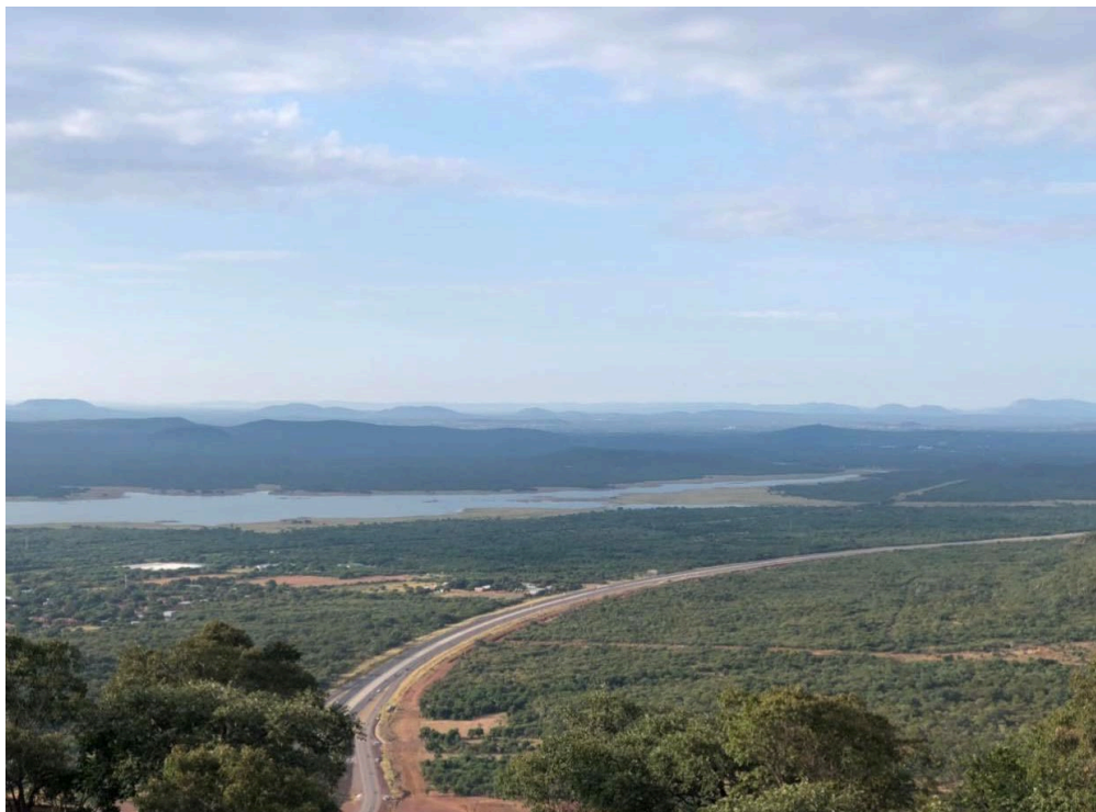
View from Kgale Hill.

I studied two courses at Botho, one in strategic marketing that is part of my master's and the project course. I was also able to study a distance learning course from KTH which took place during the same period as my exchange.