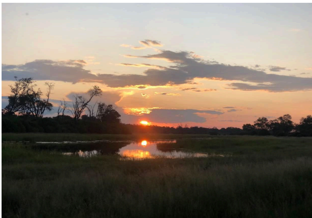
Moremi wildlife reserve.