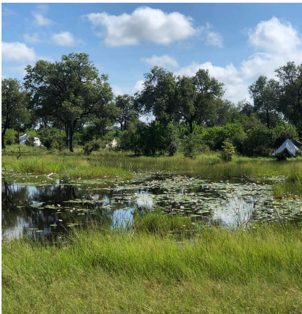
Moremi wildlife reserve.