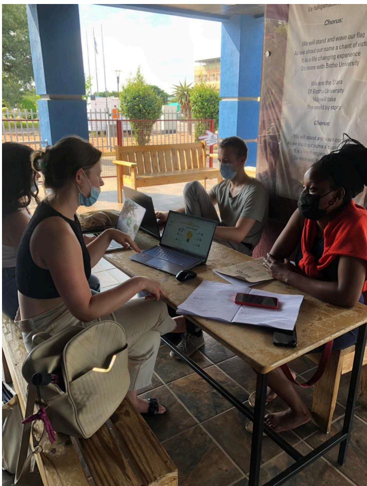
During a group meeting for project.

It was a lot of fun working together with local students, we were able to combine and exchange experiences and knowledge that really became valuable for the result.