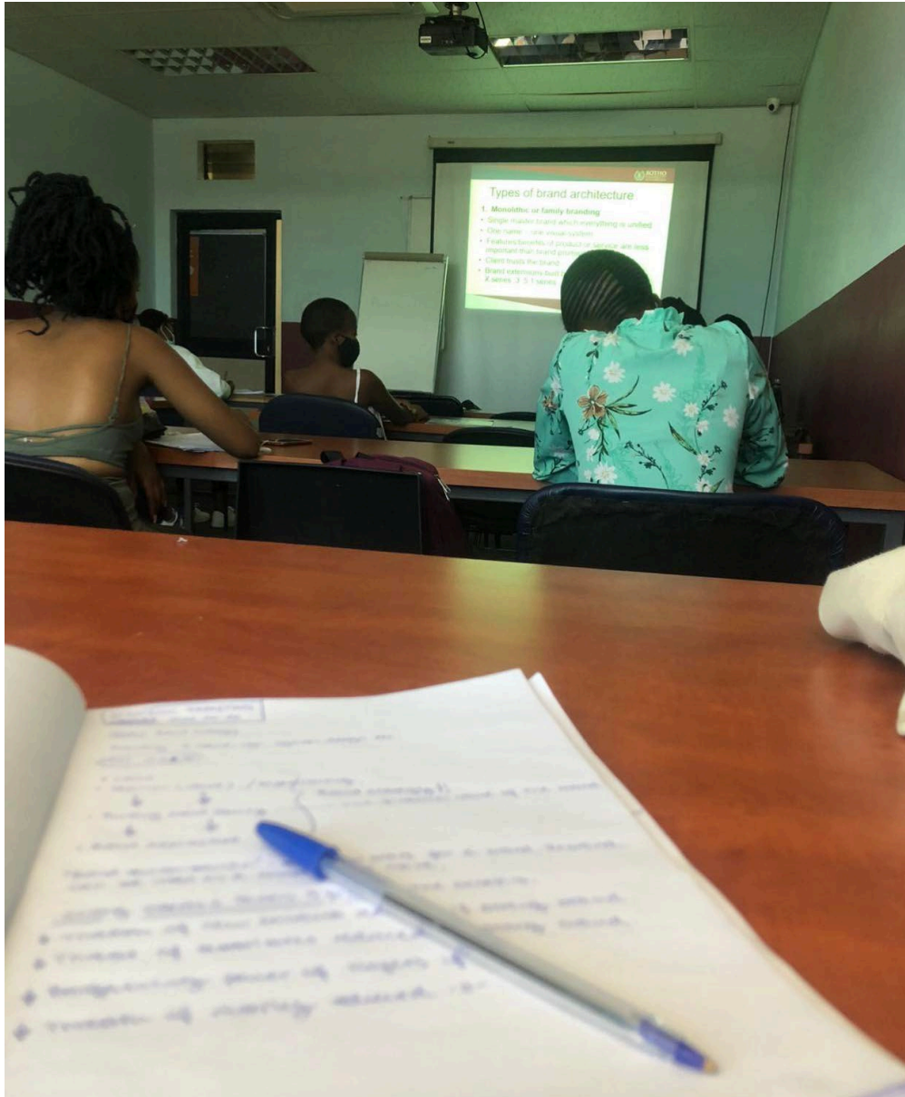
During a marketing class.

I also studied a course in strategic marketing at Botho. I had this approved in advance to be credited in my master's. I thought the structure of this course was similar to KTH with part-examination submissions and a final exam. The professor in this course was great.