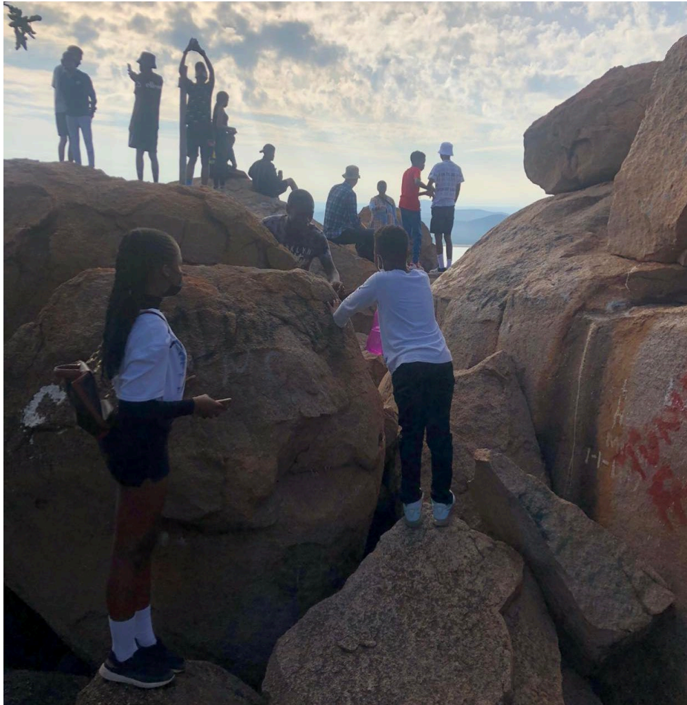
Weekend hike up the Kgale hill.

Almost every weekend there was some type of event that you could go to which was super nice, my favourite was the farmers market on the first Saturday of every month.