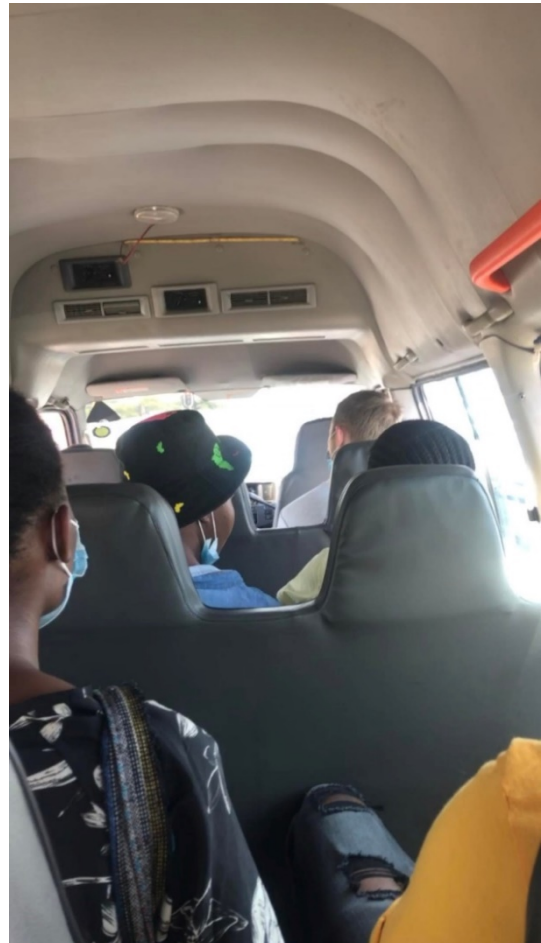
In a combi.

The advantage of combis is that it is much (!) cheaper, and they go their route without detours. However, it is difficult to understand how to ride and it can get crowded. We were not advised against taking a combi by Botho, but they recommended a taxi.