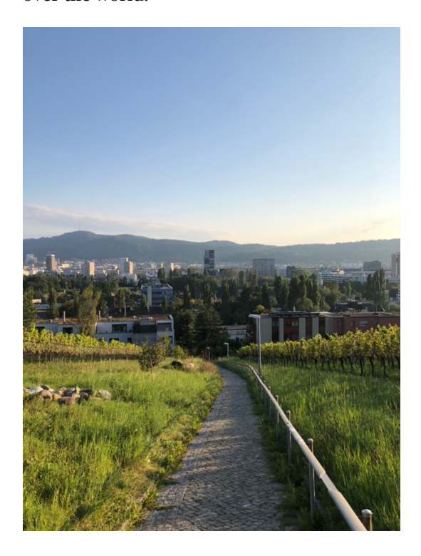
View from my walk home from school

I signed up for accommodation through the ETH website. This was very easy and required only to fill out a form. Around July I was offered a room which I accepted right away. It was close to the school, only 15 minutes with the bus. The building was nice with exposed concrete. We were 160 students sharing a kitchen which was overwhelming in the beginning but after a while I got used to it. It was mostly exchange students staying in the house, so therefore a great way of meeting people from all over the world.