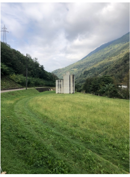
Vallis Albula, Graubünden