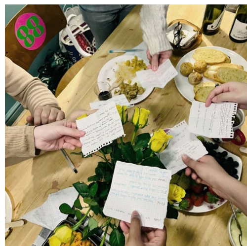
Thanksgiving dinner with my groupmates.