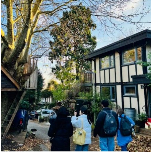
Site visit at Walter Segal, a community-led self-build housing in Lewisham, London.