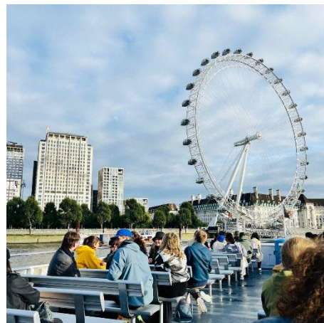
Boat trip around London arranged by BUPS.