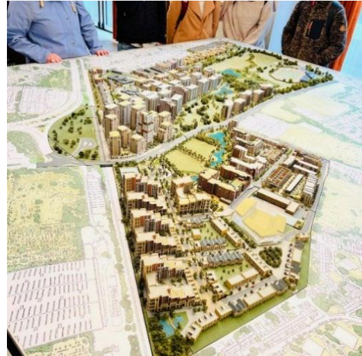
Site visit at Kidbrook village, an urban regeneration project focusing on social and ecological sustainability.