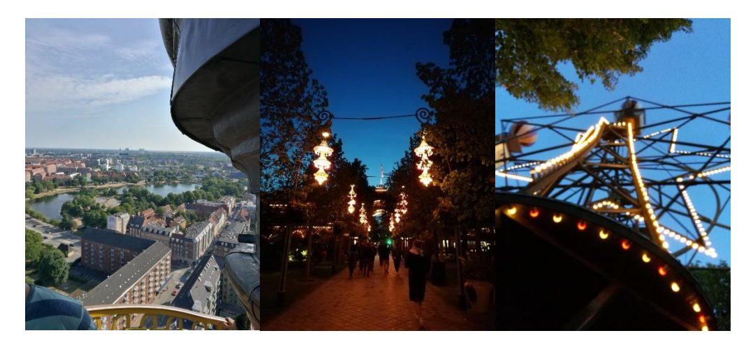
View from the tower of Vor Frelsers Kirke, and Tivoli towards the evening, when they start turning on all the lights.

Copenhagen is a lovely city, with a great atmosphere. There are tons of great shops and food places (the food court of Reffen is really popular, Torvehallerne close to Nørreport are great, and Olioli makes the most amazing poké bowls), and many nice parks and "tourist attractions". The botanical gardens and Vor Frelsers Kirke (a church in Christianshavn with a staircase running on the outside of the church tower) are two of my favourite spots, along with Ofelia plads, a square next to the theatre, where you can go for a swim in the middle of the city. Bastard café is a super popular and cosy board game café which is also highly recommended! Tivoli is also really worth a visit, with its dreamy atmosphere, beautiful gardens and concerts at a really good price!