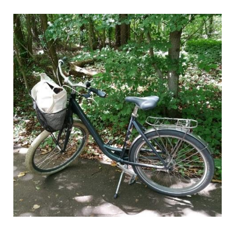
My trusty bike, that took me almost everywhere. Denmark is very flat, and Copenhagen is really well adapted to cycling, so it was a very convenient way to get around!

Apart from that, it makes a huge difference to shop for groceries in the "right" stores. Rema1000, Aldi, Lidl and Netto are quite cheap, while Irma and Føtex are a bit more expensive, and Meny is really nice, but way too fancy for my budget. Surprisingly, the canteens at DTU are actually better priced than what I'm used to from KTH, but it's of course still usually less expensive to bring your own food.